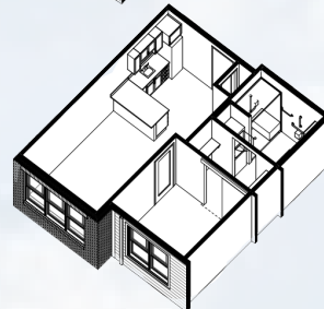
BEDROOM 1 505 Square Feet